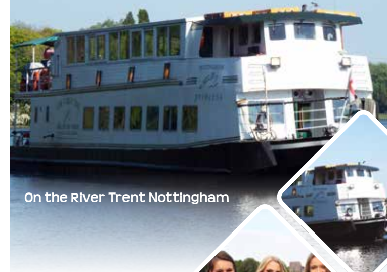
On the River Trent Nottingham